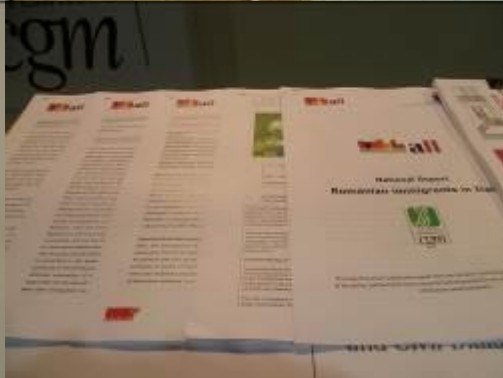
THE PROJECT MATERIALS