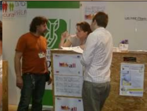
THE STAND OF THE PROJECT